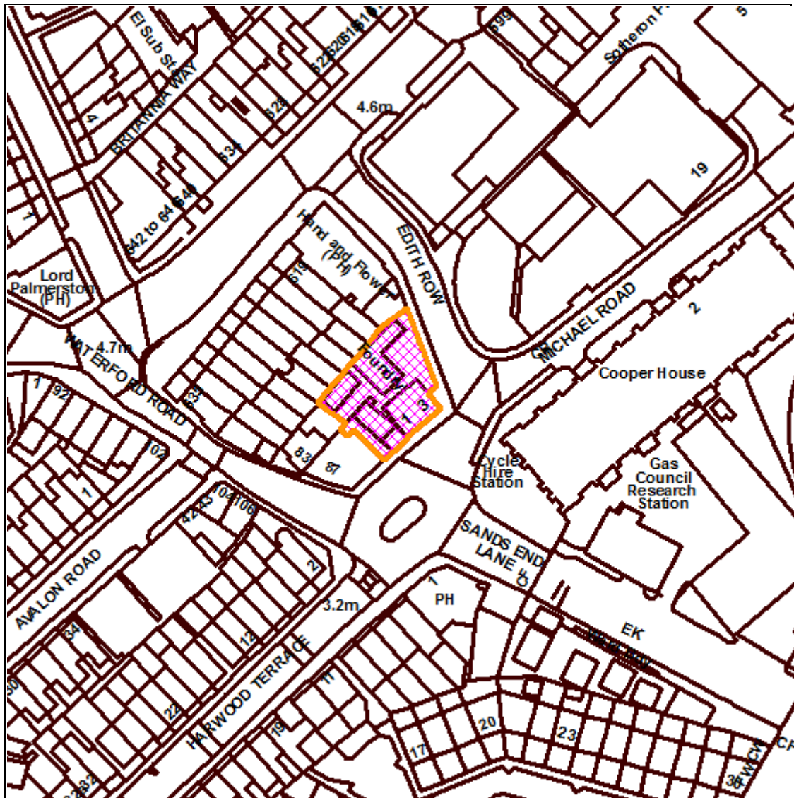
© Crown Copyright. All Rights Reserved. London Borough Hammersmith and Fulham LA100019223 (2013). For identification purposes only - do not scale.